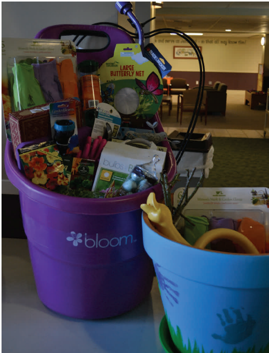
Baskets from 2015

Join us on Friday night March 4 th for our annual Art Walk/Ice Cream Social and Open House, 6:30 – 8:30 pm. We will also pull the winning tickets for our Basket Raffle at 7:30 pm. Come see the children’s art, tour the classrooms and have some Ice Cream!!!!