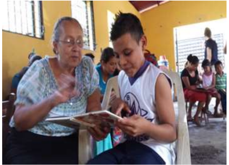
Literacy training at Iglesia Roca Eterna