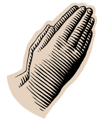
We pray ...