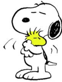
Snoopy just loves it when someone buys SCRIP and supports the Preschool!!!!

Scripts is our on-going fundraiser. With the Holidays fast approaching, don't forget to fill out an order form!!! The Preschool gets a percentage back for every dollar spent on Scripts (or gift cards). What an easy way to support this ministry!!!!