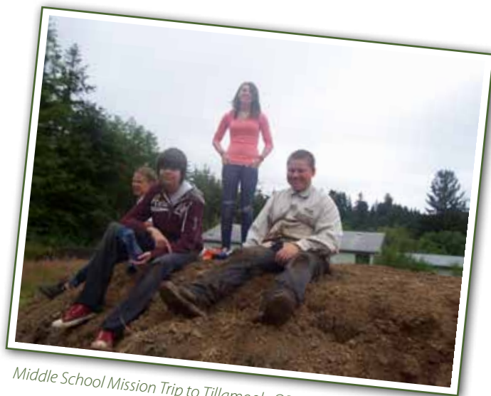
Middle School Mission Trip to Tillamook, OR

Confirmation is the time in a youth's life where they are learning and exploring their faith, in order to be ready to confirm their faith in front of the congregation. Confirmation consists of class on Sundays, youth group on Wednesdays, and various other activities throughout the year. Parent's please come to the informational meeting September 18th after second service.