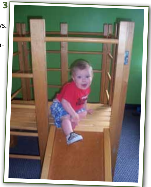
4 and under Play Group