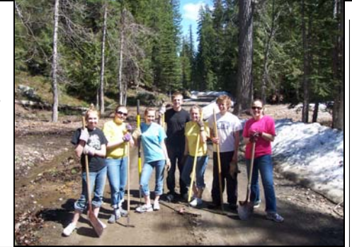
Holden Village – High school youth enjoyed a weekend up in Holden village connecting to God in new and exciting ways.