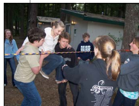
Confirmation Retreat —Camp Barracha, Auburn, WA Youth worked on faith statements, learned to work together, and spent time with leaders talking about faith.