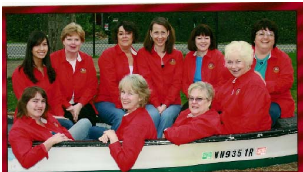
2008-2009 First Lutheran Preschool

WE ARE LOOKING FORWARD TO STARTING OUR 37TH YEAR OF MINISTRY IN SEPTEMBER. THANK YOU FOR ALL YOUR SUPPORT AND PRAYERS THROUGHOUT THE YEAR!