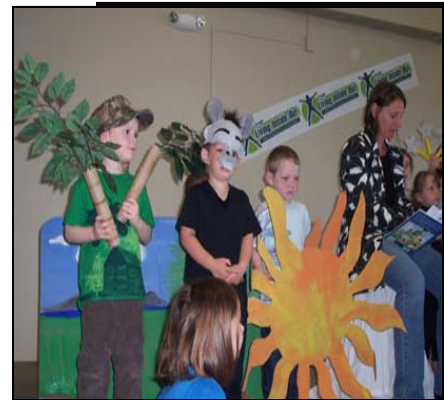
Sunday school Musical- Children shared their year of faith through skits and music.

The 2008-2009 Program year is over. This has been another exciting and faith filled year. Now it is time to look forward to the new church year, which begins in September. Please start praying about what ways you would like to be involved in the life of our congregation. We always are looking for volunteers to help in many different ways of sharing their faith with the youth and children of our church.