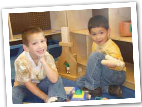
Pre-Kindergarten Lions having fun building together

Registration begins on Monday, January 31. First Lutheran Preschool & Kindergarten offers classes for children 2 1/2 years of age through Kindergarten. We offer a variety of days, morning and afternoon programs - all are age dependent. The 2011-2012 school year will mark 39 years of early childhood ministry for the Shoreline/Edmonds area.