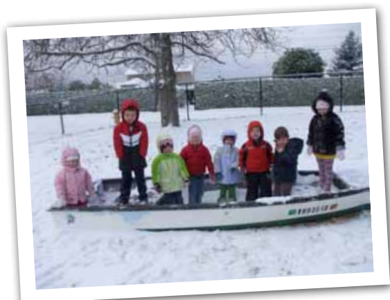
3 & 4 yr. old Doves got a chance to play in the snow before Thanksgiving!!!!