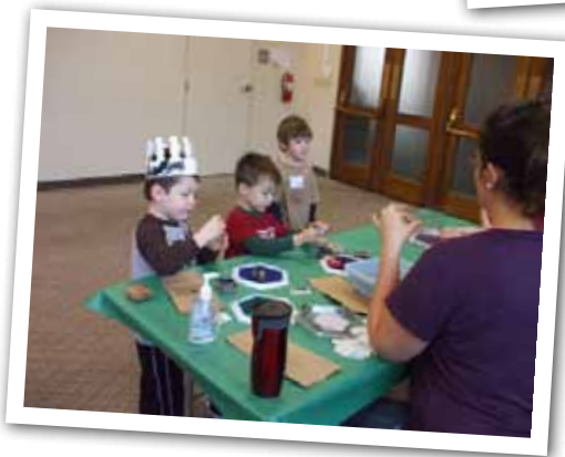
We made birthday crowns and poppers for Mary's Place!